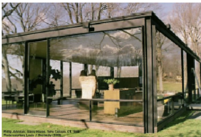
Philip Johnson, Glass House, New Canaan, CT, 1949

Registration and Payment in-full due by August 24, 2007